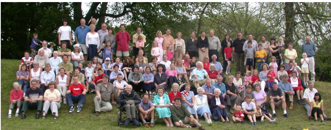
Parishioners on Golden Jubilee Day, 2002