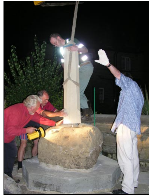
Village planning and cooperation in action - restoration of the 'Butter Cross'