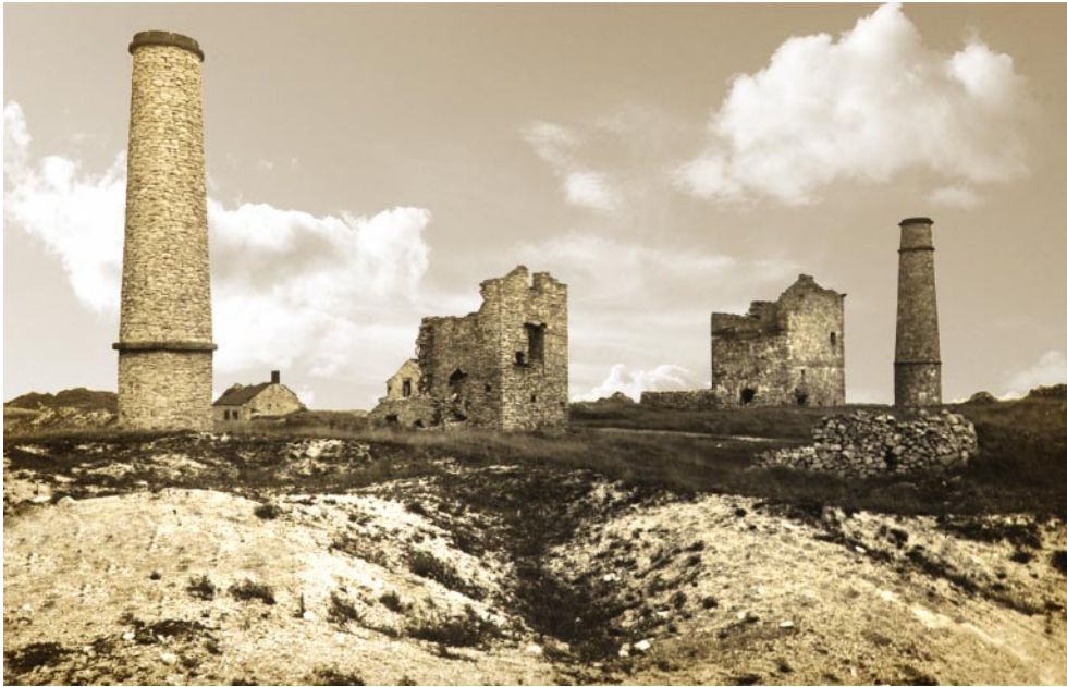
The remains of High Rake Mine, circa 1905