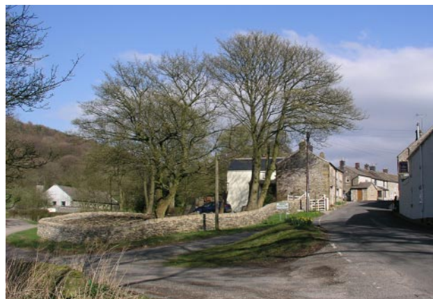
The same view approaching Great Hucklow village today