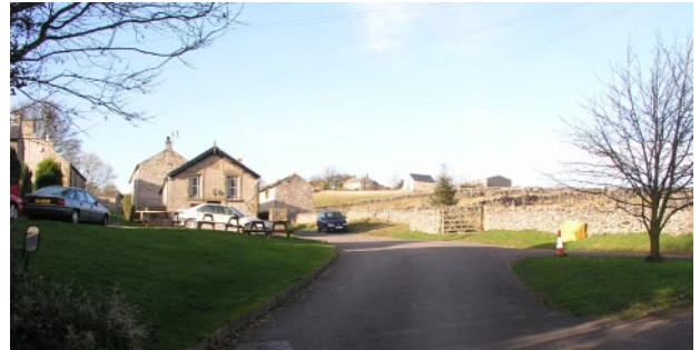
Village Green - Little Hucklow

A PC/printer/scanner/copier readily accessible to the