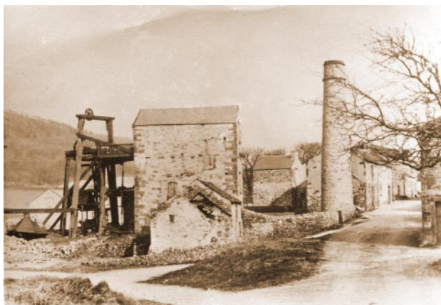
Old Mill Dam Mine, Great Hucklow