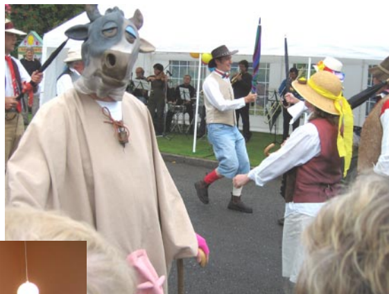
The 'Bladder Man' and Doris Dancers - Gala Day 2005