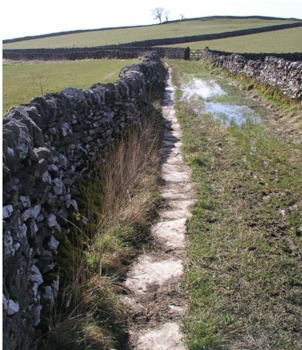
Paved path on 'Pavey Lane'

The focus of this group was on the local environment. Areas discussed included: