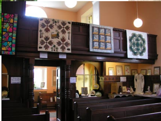
Exhibition of local crafts in the Old Chapel