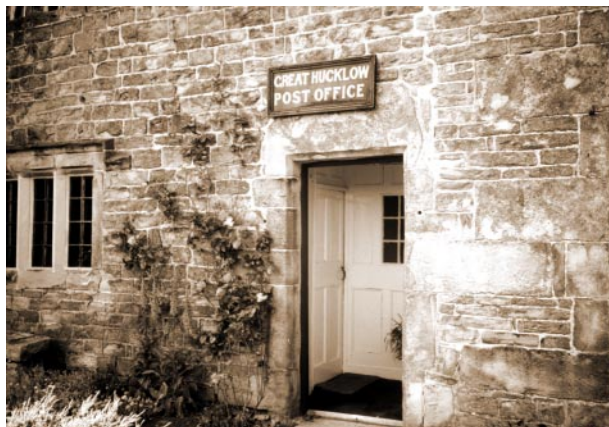
The old Great Hucklow Post Office

We are very conscious that only a small percentage of residents has Internet access at the moment, and that communications must always be available on paper as well as electronically. However, we can see that residents could benefit greatly as Internet usage becomes more general; accordingly, we wish to encourage residents to develop their skills by providing Internet access and appropriate training.