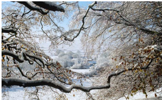
Grindlow, Spring and Winter