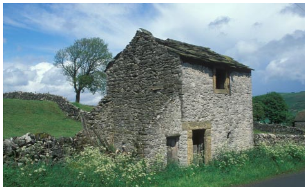
Old barn, Little Hucklow