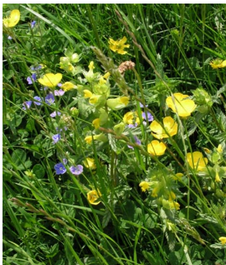
Buttercup, Speedwell and Yellow Rattle in a local meadow

We wish to express our grateful thanks to all who have helped in the process of compiling this Parish plan, for those who have taken part in the meetings of the sub-groups and to those who volunteered to write up the action plans and helped in putting the final document together.