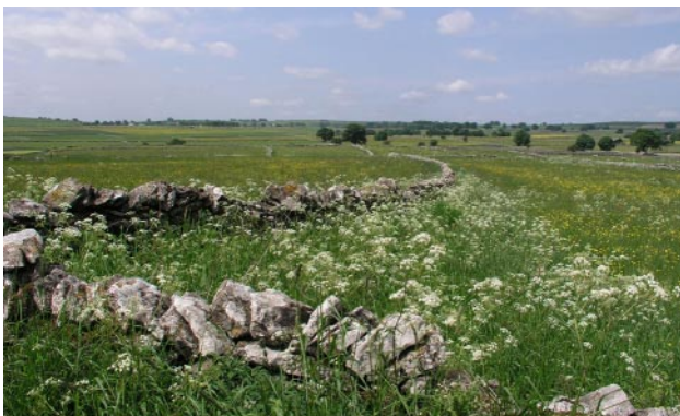
Hucklow meadow - Spring