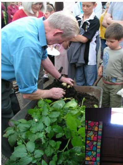
Judging the 'Great Potato Race', 2005