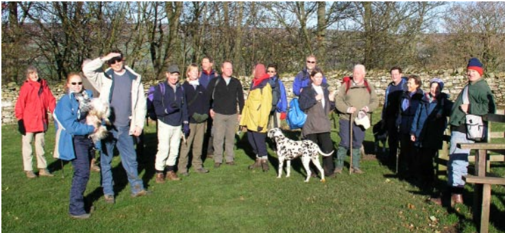
Village 'away weekend'