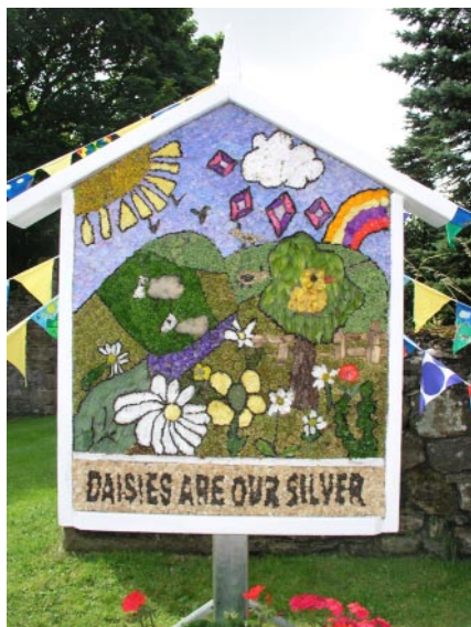
The Children's Well, 2005