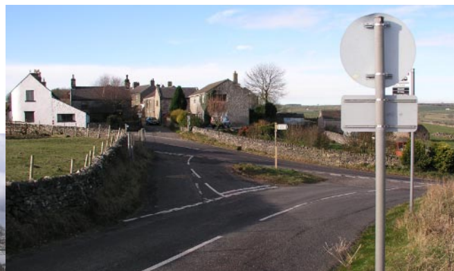
The Windmill triangle - dangerous road crossings