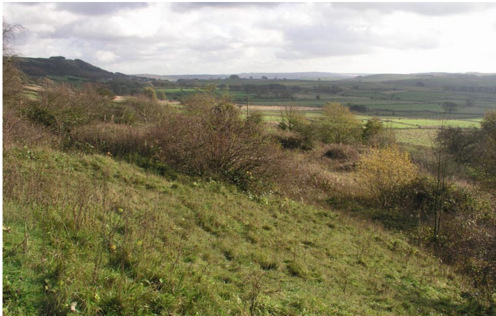
Silence Mine landscape today