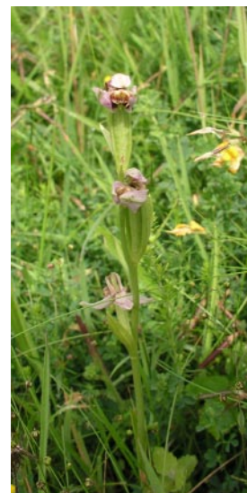
Bee Orchid and Purple Orchid at Silence Mine

Both these are community projects and although not arising out of the planning process are an important adjunct to the final plan.