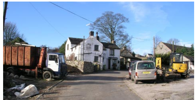
Closed pub - Little Hucklow

Several small leisure groups were suggested such as a walking group or gardening club. These are low cost requiring only one or two people with a particular interest to initiate. A book club and a pilates class have already begun and a local history interest group is evolving from the Lead Legacy project. Regular coffee mornings were suggested to provide a social meeting point. Little Hucklow has already started an informal one and Great Hucklow will have a monthly one starting after Easter.