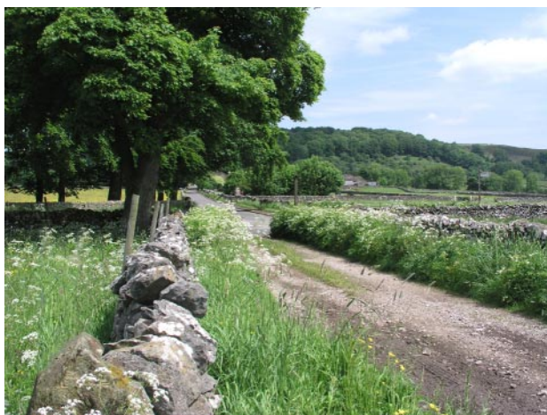
Cow Parsley on Stanley Moor Lane

The whole process has been enormously useful not only in getting to know what Parishioners see as ways in which our community and its environment might be enhanced and improved but also as an exercise in communication - people across the Parish talking to each other about mutual concerns and issues - and subsequently getting to know each other beyond mere nodding acquaintance.