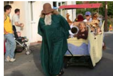
Wakes Week Pics